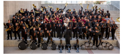
2018 CHS Band Poster Photos